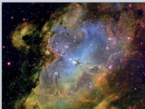
Figure 1: Physical Cosmology is based on classical physics and maintains that everything since the "Big Bang" is a series of accidents

senses, i.e., through the eyes of the flesh. If you want to know if there are craters on the moon, you extend the range of your visual sense of experience with a telescope to make this determination. If you want to know the shape and structure of a certain microbe, you explore its characteristics by amplifying your visual sense with a high-powered microscope.