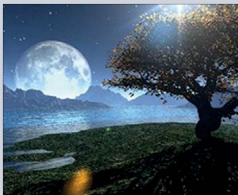
Figure 2: We can never know True Reality by trusting our five senses. What we perceive with our senses is a projection of something we could never "see" and that something is consciousness.

energy and information, constantly in exchange with all of the elements and forces of the universe.