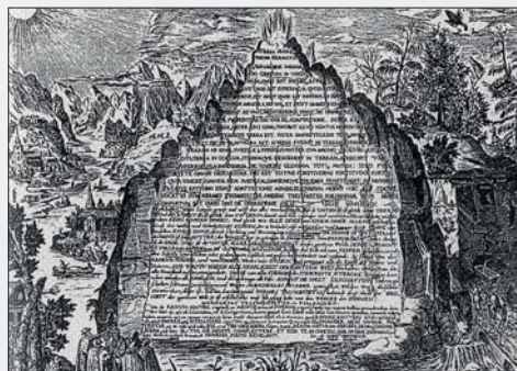
Figure 2: A 17th Century etching depiction of the Emerald Tablet by Heinrich Khunrath

more dama-ging to the skin, rather than providing the healing properties purported by the manufacturers. Mcelly Bouquet™ products are used exclusively in Mcelly SPA, and currently sold only at Chateau Mcelly and at its Boutique E-Shop ( http://www.chateaumcelly.com/eshop/en/mcelly-boutique/ ).