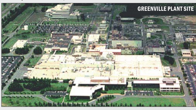
Figure 3: Catalytica Pharmaceuticals acquires Glaxo's 300-hectare modern pharmaceutical plant in Greenville. NC.

Yes, the coals in the entrepreneurial fire can be very hot at times, but there really is nothing quite so rewarding as building something new, something that truly makes a difference in this world.