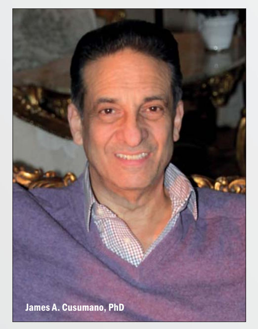
"Happiness is not a goal; it is a by-product". Eleanor Roosevelt