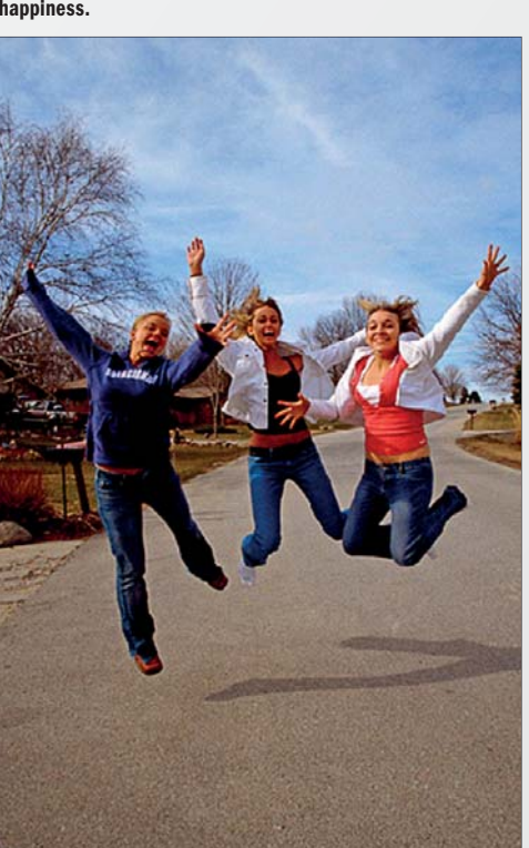
Figure 2: Following your sense of purpose leads to passion which unleashes creativity that generates innovation providing a sense of gratitude, which is the source of all lasting happiness.

one wants to work hard without some level of accomplishment.