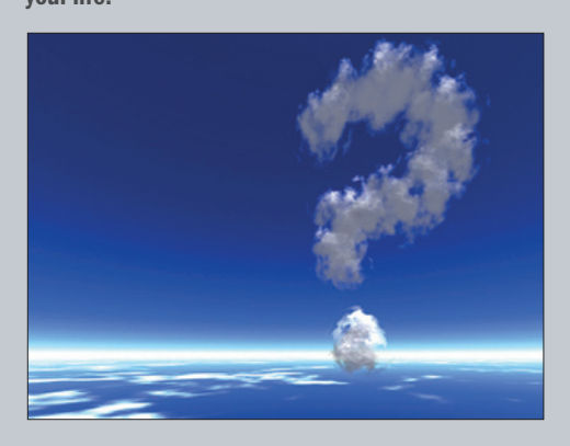
FIGURE 1: Your answer to the Ultimate Question has profound implications for the quality of the rest of your life.

Leading corporate strategist, Gary Hamel and the results of several Gallop polls show that only 20 percent of people in the developed world are engaged and fulfilled in their jobs.<sup>3</sup> People in the other 80 percent, fall in a range between just collecting a paycheck, to outright distaste for their job and their employer. It's not that they are not talented; they almost inevitably are, but not at the job they are currently doing.