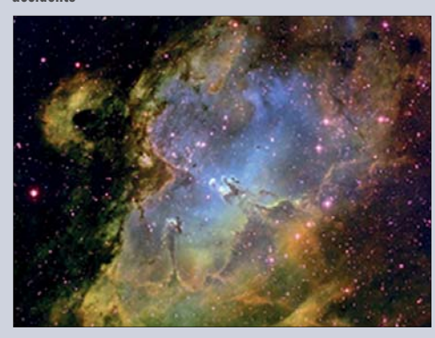
Figure 1: Physical Cosmology is based on classical physics and maintains that everything since the "Big Bang" is a series of