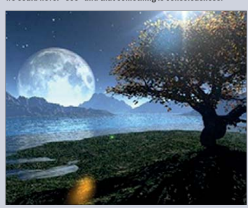
Figure 2: We can never know True Reality by trusting our five senses. What we perceive with our senses is a projection of something we could never "see" and that something is consciousness.

energy and information, constantly in exchange with all of the elements and forces of the universe.