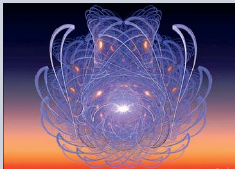
Figure 3: Through the infinite presence of Consciousness, it is possible to manifest your dreams and desires through intention and attention with detachment