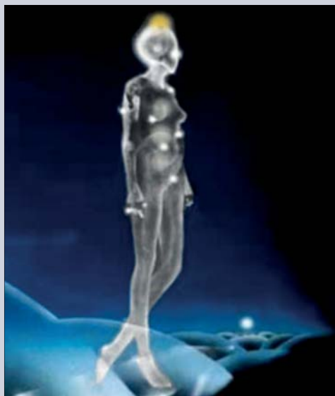
Figure 1: Cosmic, Collective and Personal Consciousness are infinite and connect all matter in the universe. They also completely penetrate the “nothingness” of infinity.

instantly – faster than the speed of light. It is the consciousness at work when you think of someone, and in a matter of minutes or seconds, the telephone rings with that person on the other end. And it is the consciousness at work when you seek to manifest something into your life. Cosmic, Personal and Collective Consciousness are infinite and intimately connected.